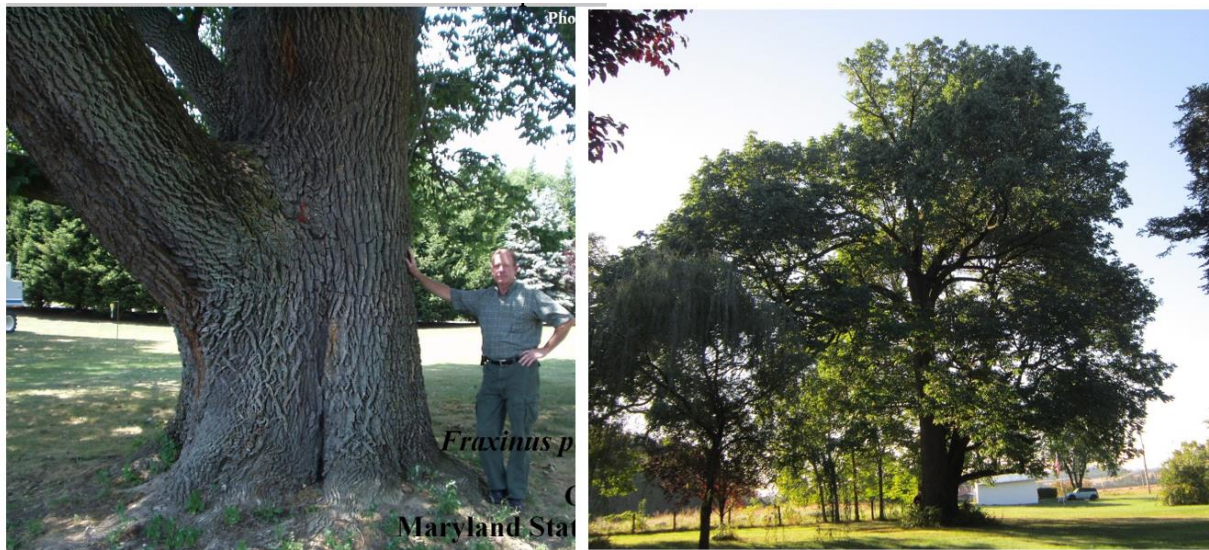
Figure 1. Trees referenced in the MD Big Tree Program Report.

MBTP Report – Cecil – BT-1493, Maryland State Champion Green Ash did not leaf out this spring and is presumed dead. By an unfortunate coincidence, the owner died April 25 th . It was last measured in 2017 and scored 347 points.