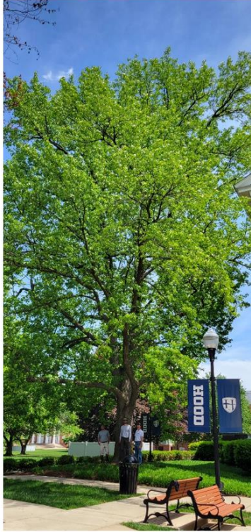
Hood College Sweetgum