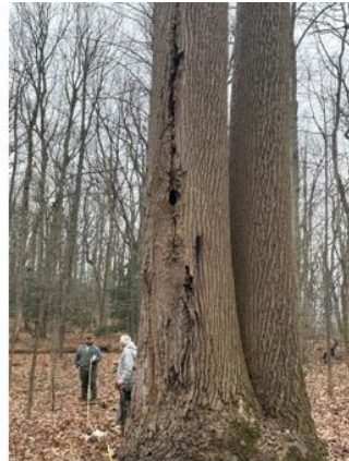
Elk Neck State Forest Yellow-poplar