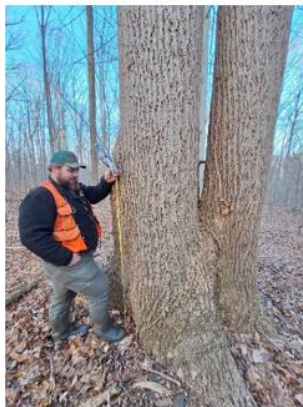
Stoney Demonstration Forest Yellow-poplar