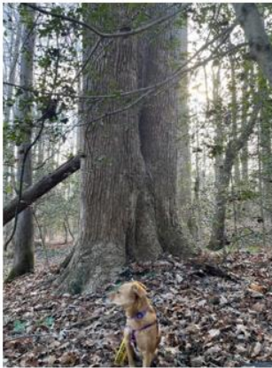
Cedarville State Forest Yellow-poplar